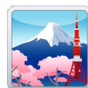
Photo Japan Guide App icon sample

* This fee is for users purchasing from the United States. Fees will vary by country.